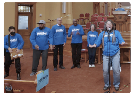
Members of StreetSong MN