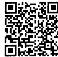
Scan QR code to distribute food bags.